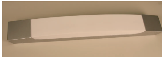
File Photo in Metallic Nickel