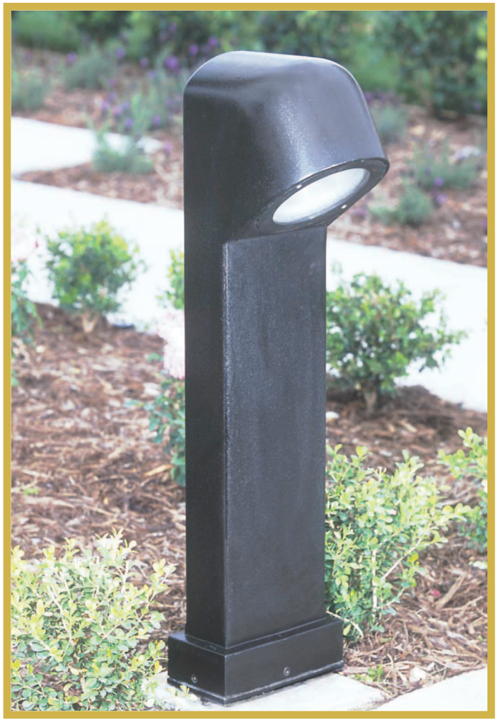
Left: Aurora Bollard, Size 20. Right: Size 30.