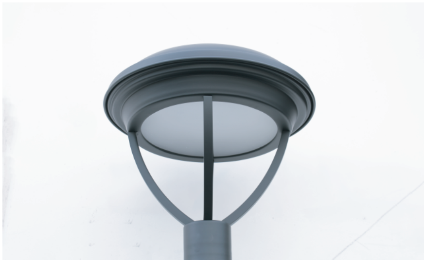
4" Slip fitter

With GFI 20 AMP RECEPTACLE AND WATER PROOF COVER IN BASE FOR 120V PLUG IN