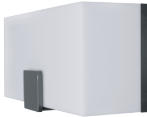
White Frosted acrylic box