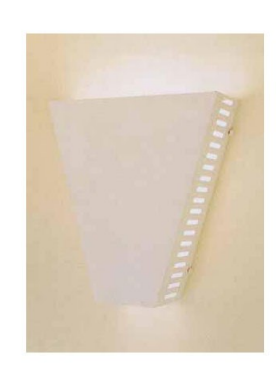
9"H X 9"W X 4"D 12"H X 12"W X 4"D 16"H X 16"W X 5"D