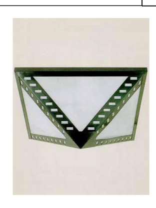
10"Wide X 5" Deep 14" Wide X 5" Deep 18" Wide X 7" Deep