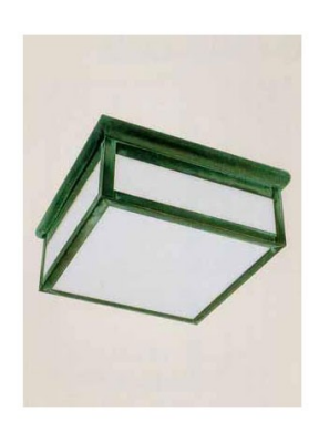
10"Wide X 5" Deep 14" Wide X 5" Deep 18" Wide X 6" Deep