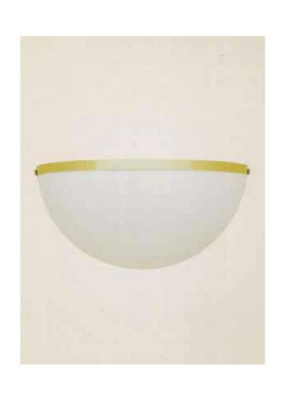
6"H X 12"W X 4"D 8"H X 14"W X 4"D

Driver Options: 0-10V Dimming Phase Dimming Triac Dimming