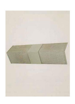
6"H X 20"W X 5"D